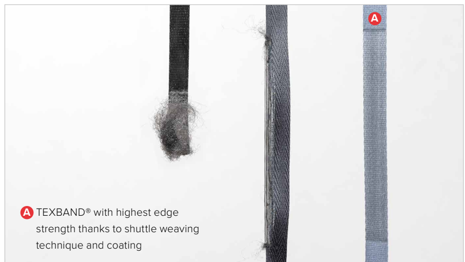
A TEXBAND® with highest edge strength thanks to shuttle weaving technique and coating

In laboratory tests with edge and surface abrasion, TEXBAND® achieves significantly higher service lives than tapes without coating.